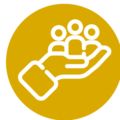
Child Safe Policy

These documents place the best interest of the children and young people first and provide the platform for any member of the school community to respond to and report a child safe incident or concern. It also provides guidance on how to manage child safe complaints.