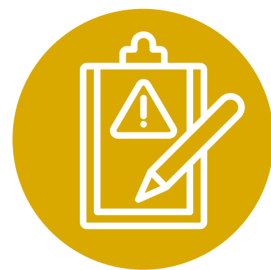
Reporting Incidents and Concerns