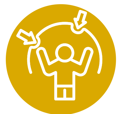
Professional Boundaries of Staff