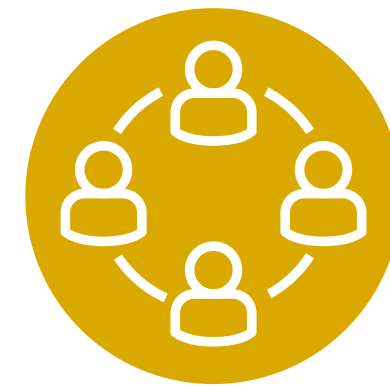
Student Code of Conduct